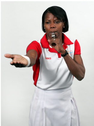
A: Toss Up